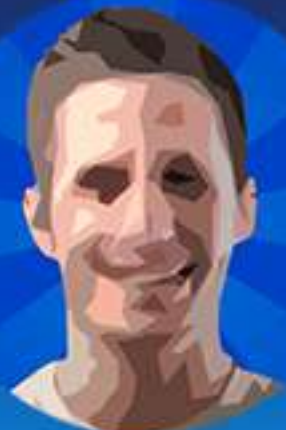
Azzi Solidity Developer